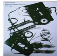
Various Artists - Kassetentater

Although this Australian band's excellent live recordings (also available on Mutant Sounds) link it more with the post-punk label with which its associated, this album of disarmingly haunting instrumentals sounds like it was recorded using an old, slightly out-of-tune piano discovered in an abandoned haunted Victorian manor and other curios of musical instrumentation. It creates a watery world that plays in much the same area as Eno's ambient, minimalist approach to composition circa Another Green World .