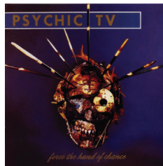
Psychic TV - Force The Hands of Chance

For those just perusing Mutant Sounds for the first time, the breadth of music on offer can seem overwhelming. First and foremost, you are encouraged to hold your breath and dive in. Almost everything posted is a unique gem that can be appreciated and marveled at within its context. Furthermore, the albums best lend themselves to personal discovery and seem meant to be communed with on a one-to-one basis. That said, here's a short list of some personal favorites with which you can't go wrong. These are just a small sampling of the albums that have opened my mind to new musical directions and experiences to which I continue to return. All of these can be easily found using the search box at the top of the site.