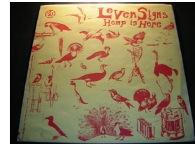
Leven Sounds - Hemp Is Here