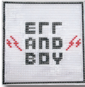
ERRAND BOY Errand Boy 001 Collective

esoteric treasure, wrenched from the bowels of obscurity.